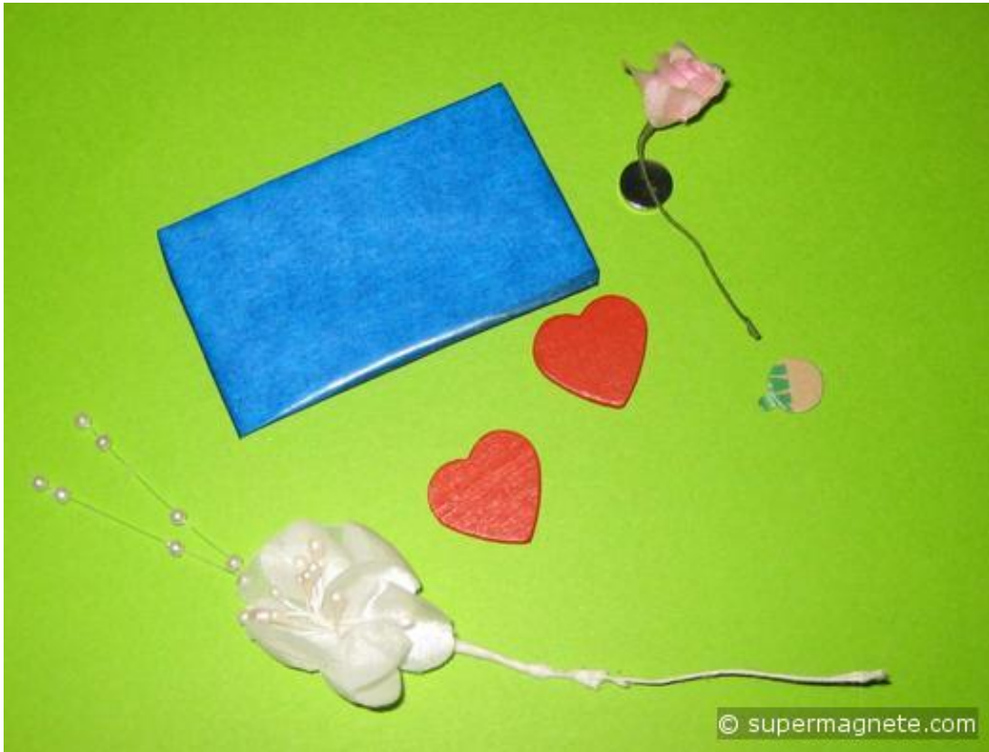
Same concept, different style