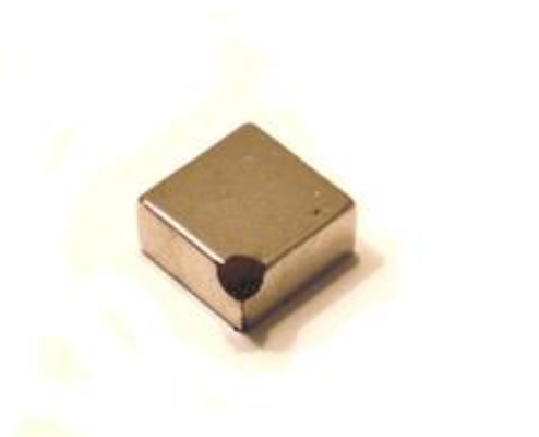
Magnet full of iron filings

It is fascinating to experiment with magnets (in the picture: THE GIANT ( www.supermagnete.nl/eng/Q-25-25-13-N )) and iron filings ( www.supermagnete.nl/eng/M-22 ). But who ever tried to remove iron filings (or small splinters of other magnets) from magnets will know that this can be very cumbersome. I found a simply solution: