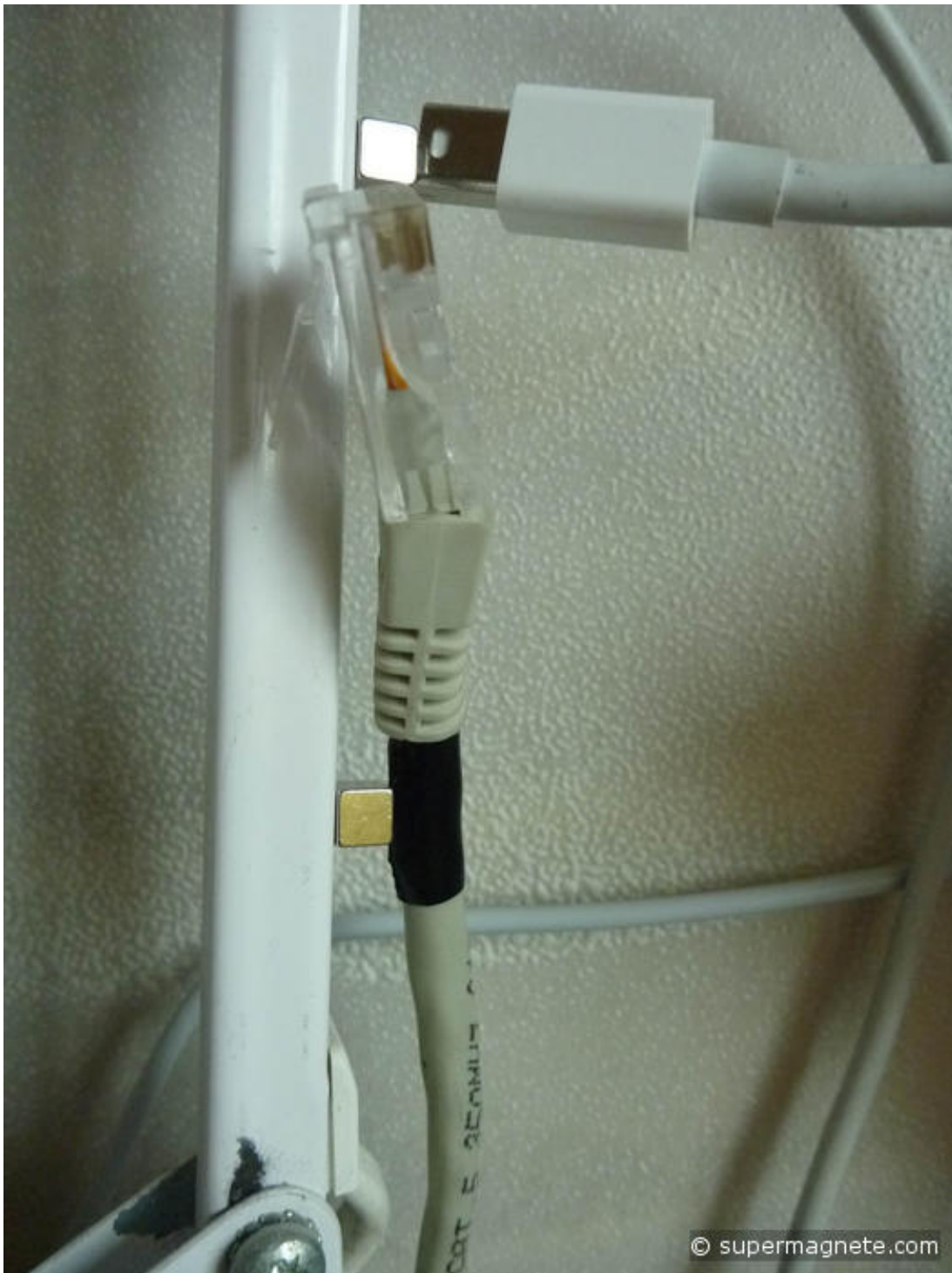
The metal of the paperclip hides under the black adhesive tape.

Note from the supermagnete team: A similar application is the project "Cleaning up your computer work space" ( www.supermagnete.nl/eng/project319 ).