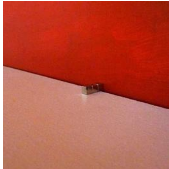
Shelf with magnets

The first block of three I placed in the centre of the shelf at the back of the back panel. You can clearly see the annoying gap here.