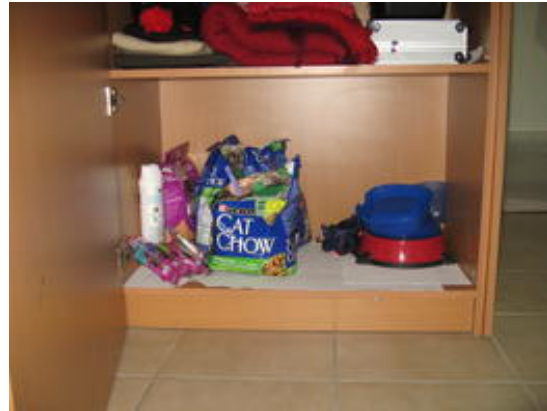
A totally normal cabinet - you would think

In Mexico people are a little wary of strangers in their house (housekeepers, workers, babysitters, etc.). That's why they have to think of new ways to hide their jewellery and cash safely.