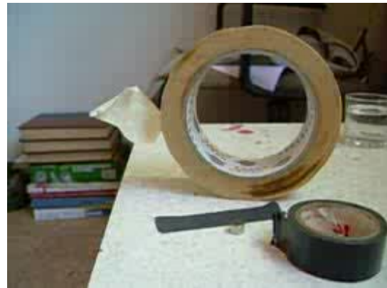
Video, 4.1 MB

Here you can see in detail how I proceeded with the tape. In this version you cannot see the magnets. Maybe you like this version better - spectators might be even more impressed if they don't get the principle right away.