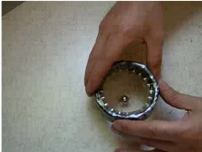
Video, 2.7 MB

As soon as the roll is placed over the rotor, it starts rotating.