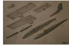
pdf file, 650 kB

If your Spanish is better than mine, please check out the PDF with a lot of additional information (only in Spanish).