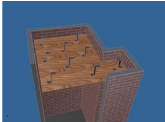
Slanted view from above

Thanks to its many magnets the board is secured to the beams.