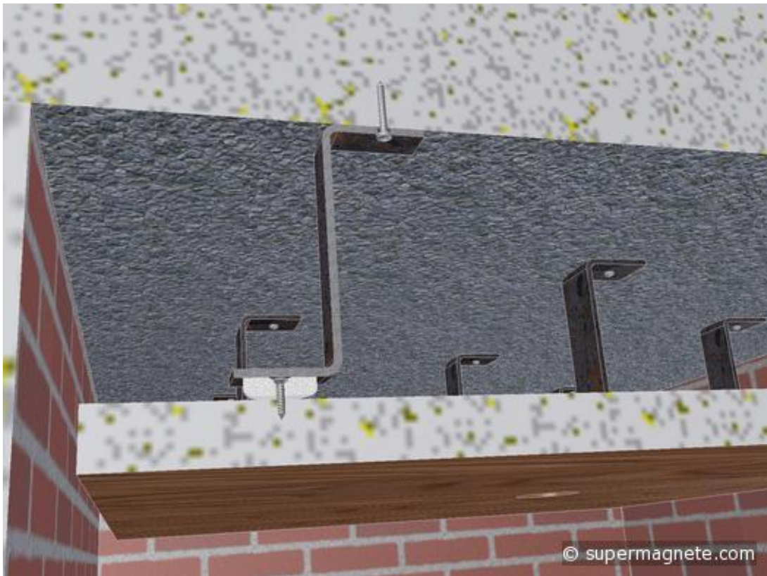
The computer graphics show where the screws are attached.

At last, he could stick the board with magnets onto the steel beams.