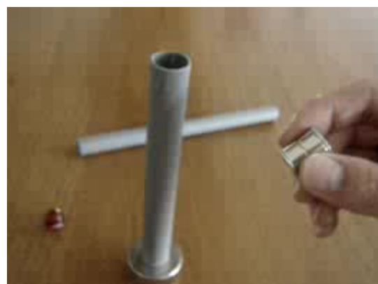
Video, 1 MB

When the magnetic package goes below a certain distance to the ring, it suddenly is strongly drawn to the ring opening. The marble up front will be shot off with quite some force. The video shows how well that works!