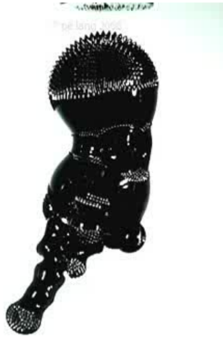
Video, 2.4 MB

The density of the fluid is comparable to that of motor oil. A sculpture is approx. 9 cm in height and has a diameter of approx. 4,5 cm. The weight varies from 80 - 100 g.